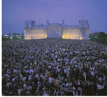
Fig. 2. Wrapped Reichstag , Berlin, 1971-95 Christo and Jeanne-Claude, Photo: Wolfgang Volz ©1995 Christo

aesthetics, in a radically different way than eighteenth- and nineteenth-century philosophers conceived these processes? We easily discredit the idea of humors as ruling temperaments of the body but know that Kant considered them viable and one of them as an indication of the absence of temperament [42]. We still read Kant for his interpretations of physical and psychological states, yet not on his theory of the phlegmatic humor.